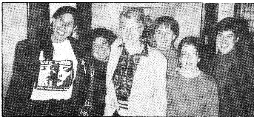
A few of the participants at the Women's Networking Breakfast, Washington, D.C., 1994.