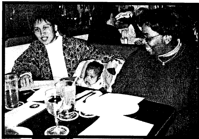
Some caucus members enjoying themselves at the LGB Caucus Dinner at the APHA Annual Meeting in Washington, D.C., November, 1998.

This newsletter, our web page, our tradition of subsidies to students so that they are able to attend our Annual Dinner, and all of our work is possible because of the money, resources and time donated to the Caucus by our members. Our ability to expand our work increases with every contribution. As we get ready to plan for our 25th anniversary celebration next year in Boston, extra donations will be needed to give the event the shine that it needs not only for the benefit of our members but to let all of our colleagues in public health know that we are here and we are strong. Therefore, please consider making an especially generous donation this year. It will be well spent. See you in Chicago!