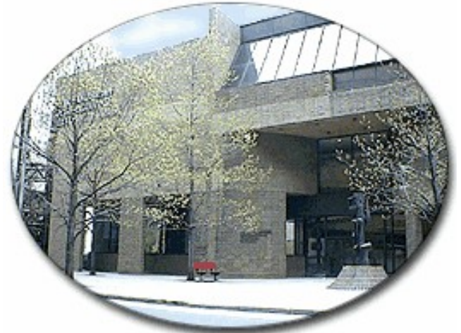
African-American Museum on Arch Street in the “Old City” neighborhood in Philadelphia, PA